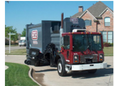
Correct Cart Placement